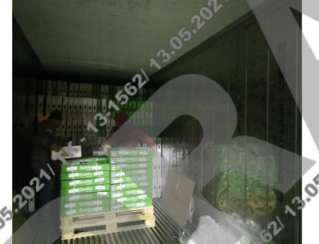
The process of loading container