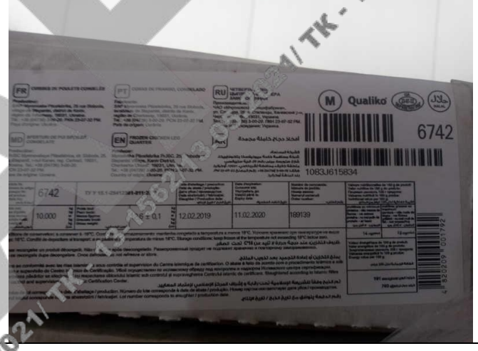
The Photo of package and label