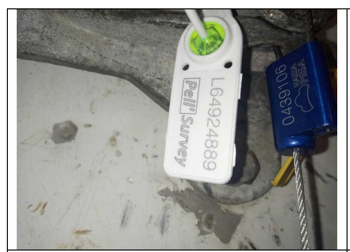
Seal Pull' Survey