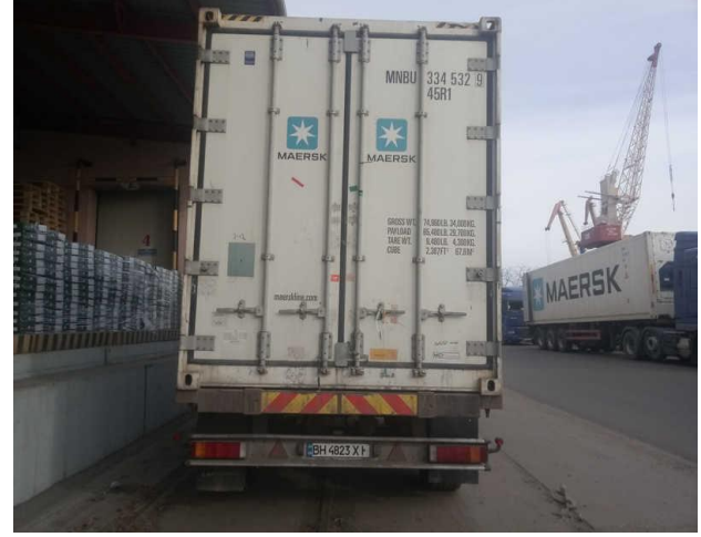
Bolt seal Sealed container