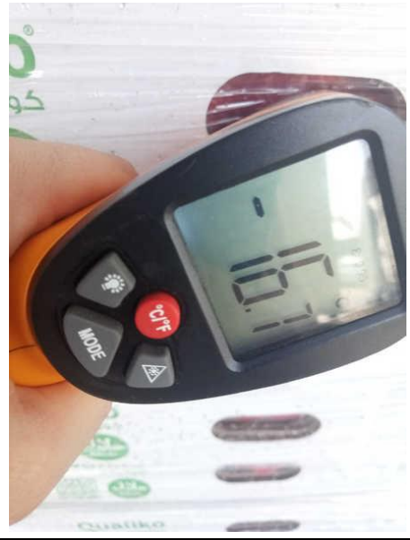
Temperature of the product after loading operation into container