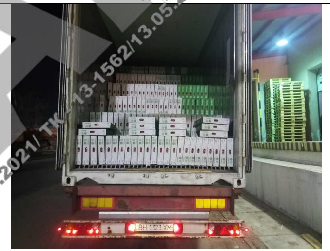
The full container