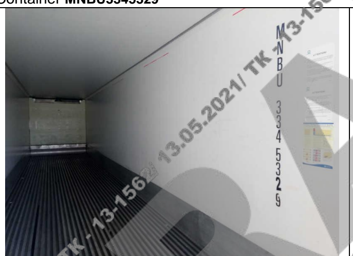
Container control for cleanliness