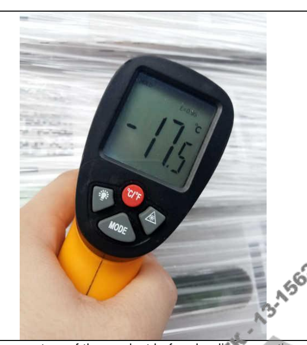
Temperature of the product before loading operation into container