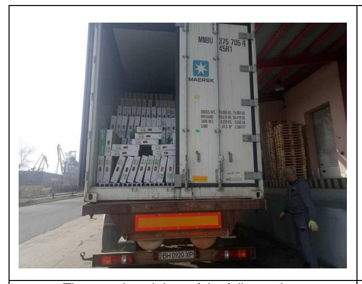
The one closed door of the full container