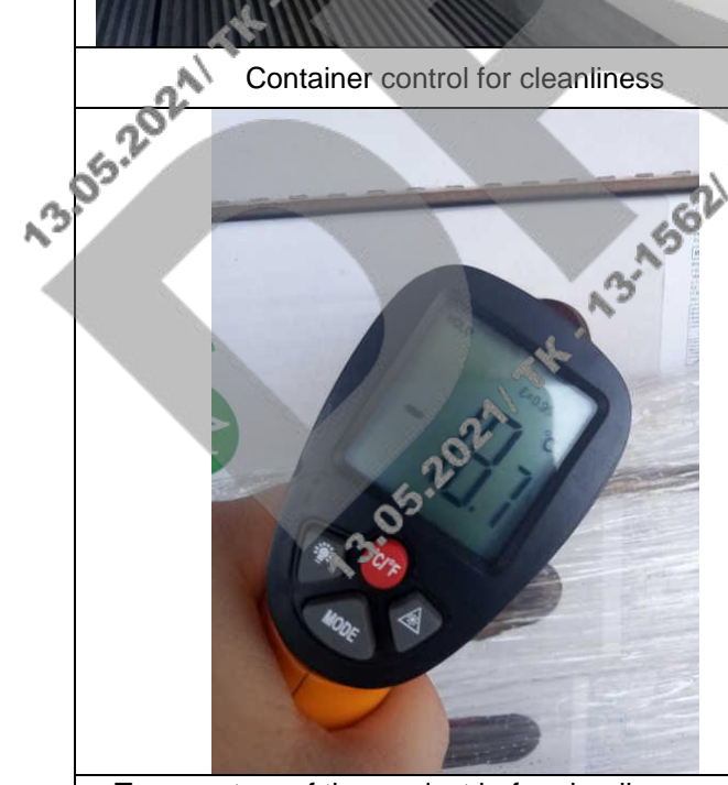
Temperature of the product before loading operation into container