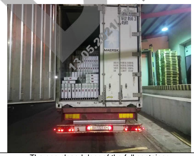
The one closed door of the full container