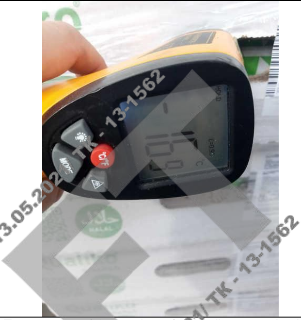
Temperature of the product after loading operation into contair er