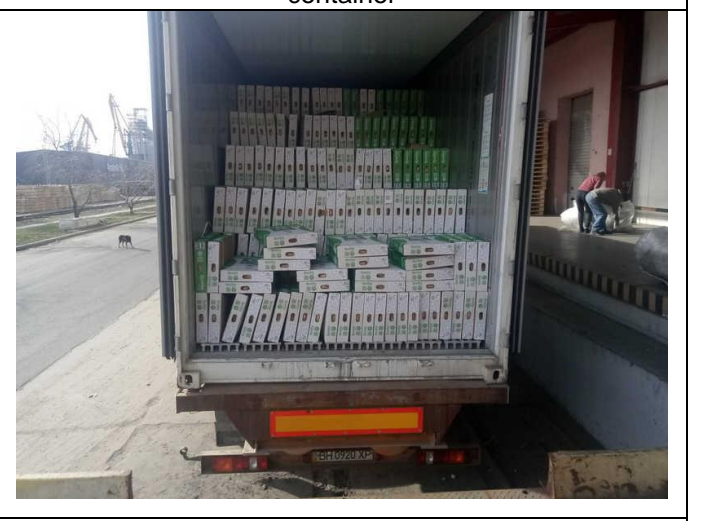
The full container