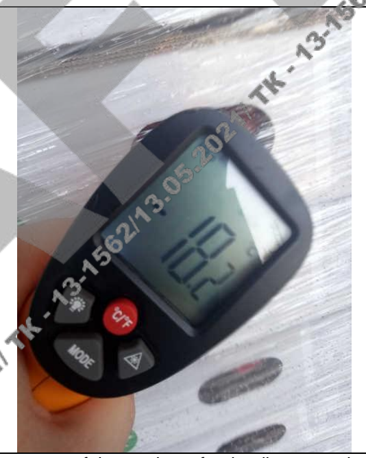
Temperature of the product after loading operation into container