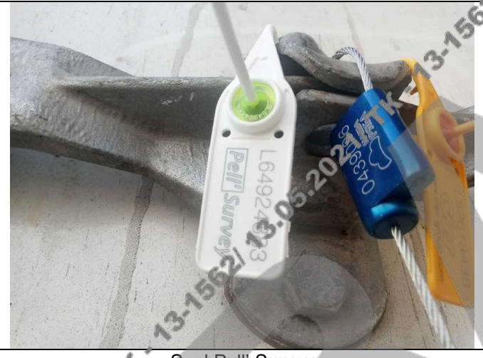
Seal Pull' Survey