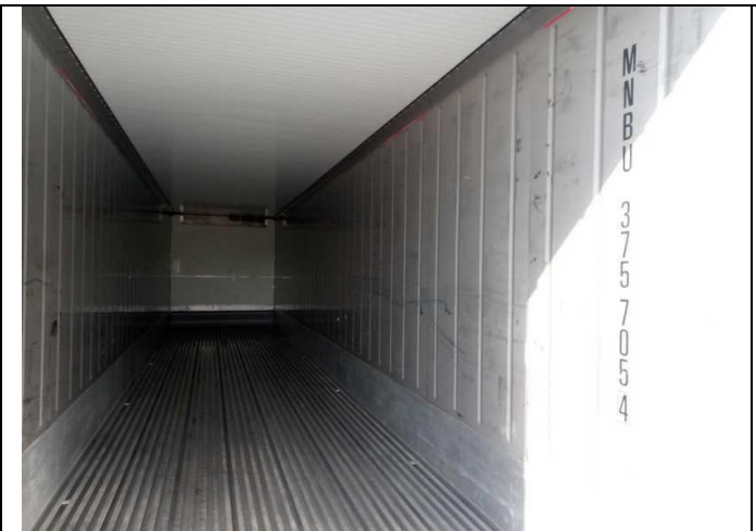
Container control for cleanliness