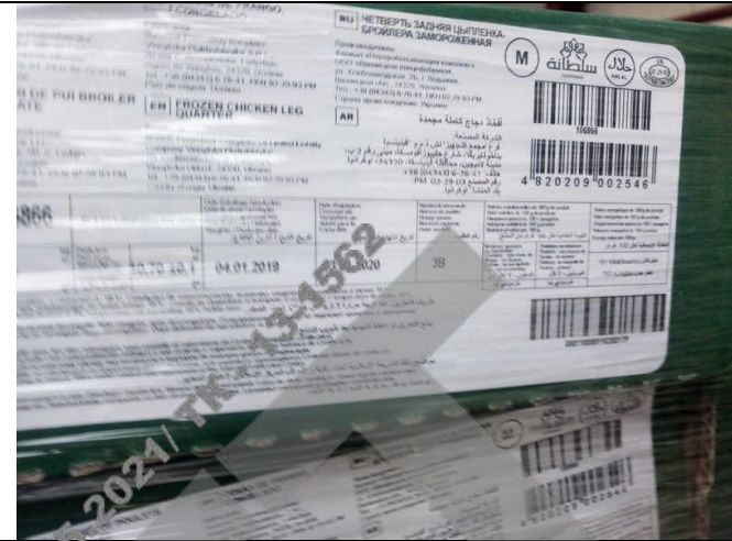
The Photo of package and label